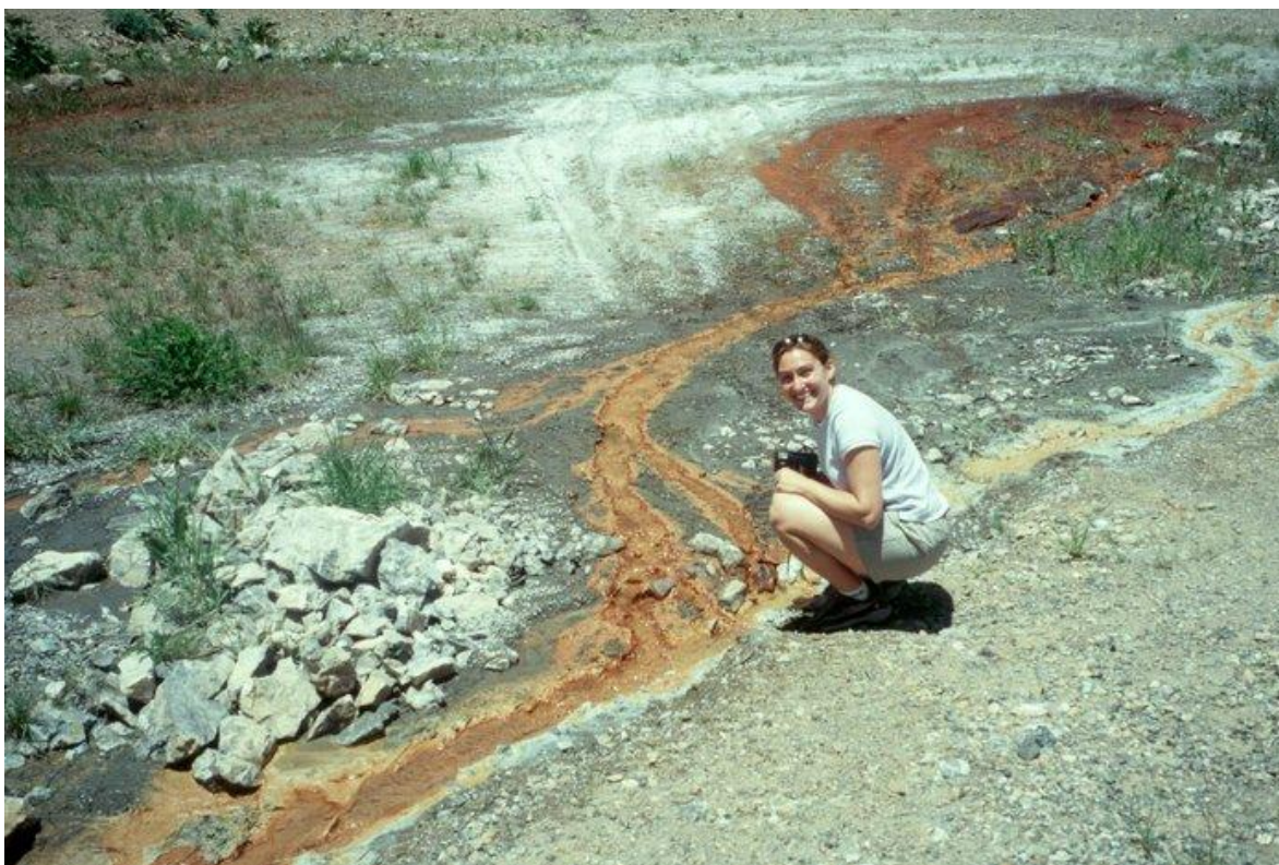
ACID SEEP — Acid Seep in Nevada — Get Photo ( /photos/acid-seep/ )