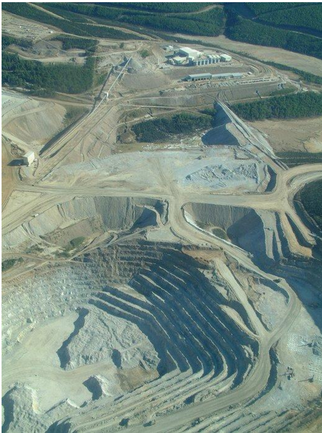
FORT KNOX PIT — Fort Knox Mine (/Issues/MetalsMining/FortKnoxMine.html) — Get Photo (/photos/fort-knox-pit/)