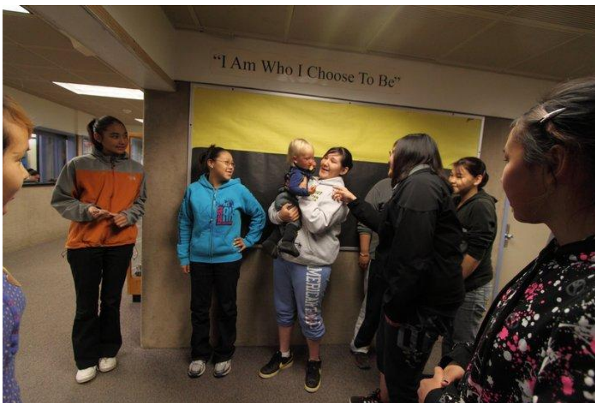
ARCTIC 2010 LEG 2 — In the Kivalina School — Get Photo ( /photos/arctic-2010-leg-2/ )

Jim acknowledged all this, then pushed it aside. “Maybe, eventually, there’s a point where we just don’t care anymore. Maybe society has other issues by then.”