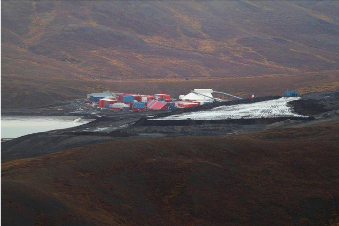
RED DOG MINE — Facilities situated between the tailings pond (at left) and the mine (not visible.) Waste rock piles are in the foreground.

The iconic symbol of a happy red dog and the words “Red Dog Mine” graced tote bags and sweatshirts throughout the village of Kivalina. A twelve year old boy in the house we stayed in talked about his ambition to operate machinery in the mine when he grew up – a job that would let him continue to live in Kivalina between shifts at the mine.