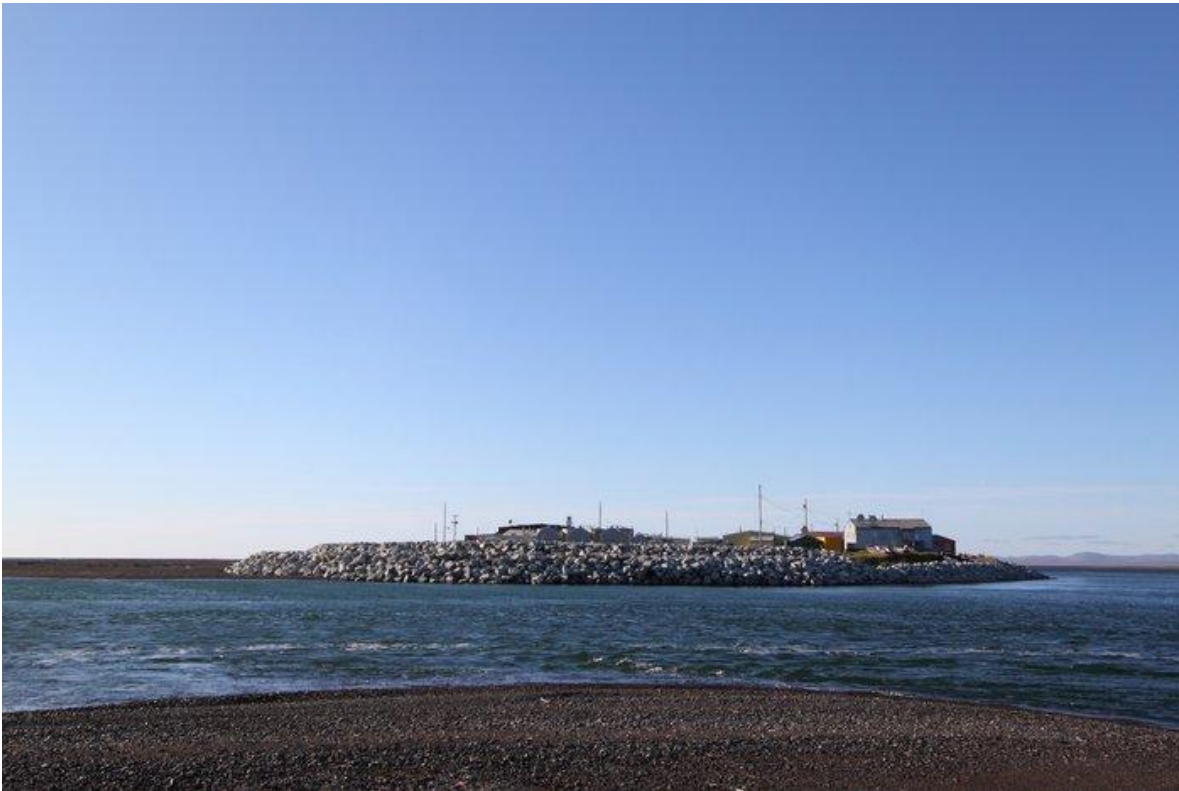
LEG 3 — Kivalina and its sea wall — Get Photo (/photos/leg-3/)

During a fall storm in 2007, hundreds of Kivalina villagers evacuated to the Red Dog Port. Watching Katmai play in the dining room, our host at the port reminisced fondly about the halls full of children during that storm - unusual in a camp where there are never families, only workers.