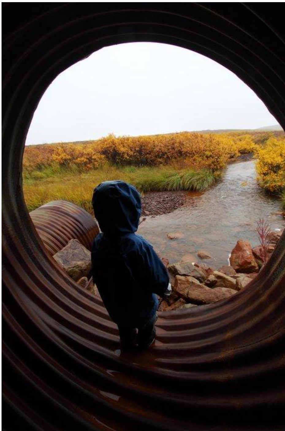
IN THE TUBE — Katmai looks out of a flood culvert on a quarry road near Red Dog Mine ( /Issues/MetalsMining/RedDogMine.html ). — Get Photo (/photos/in-the-tube_4/)