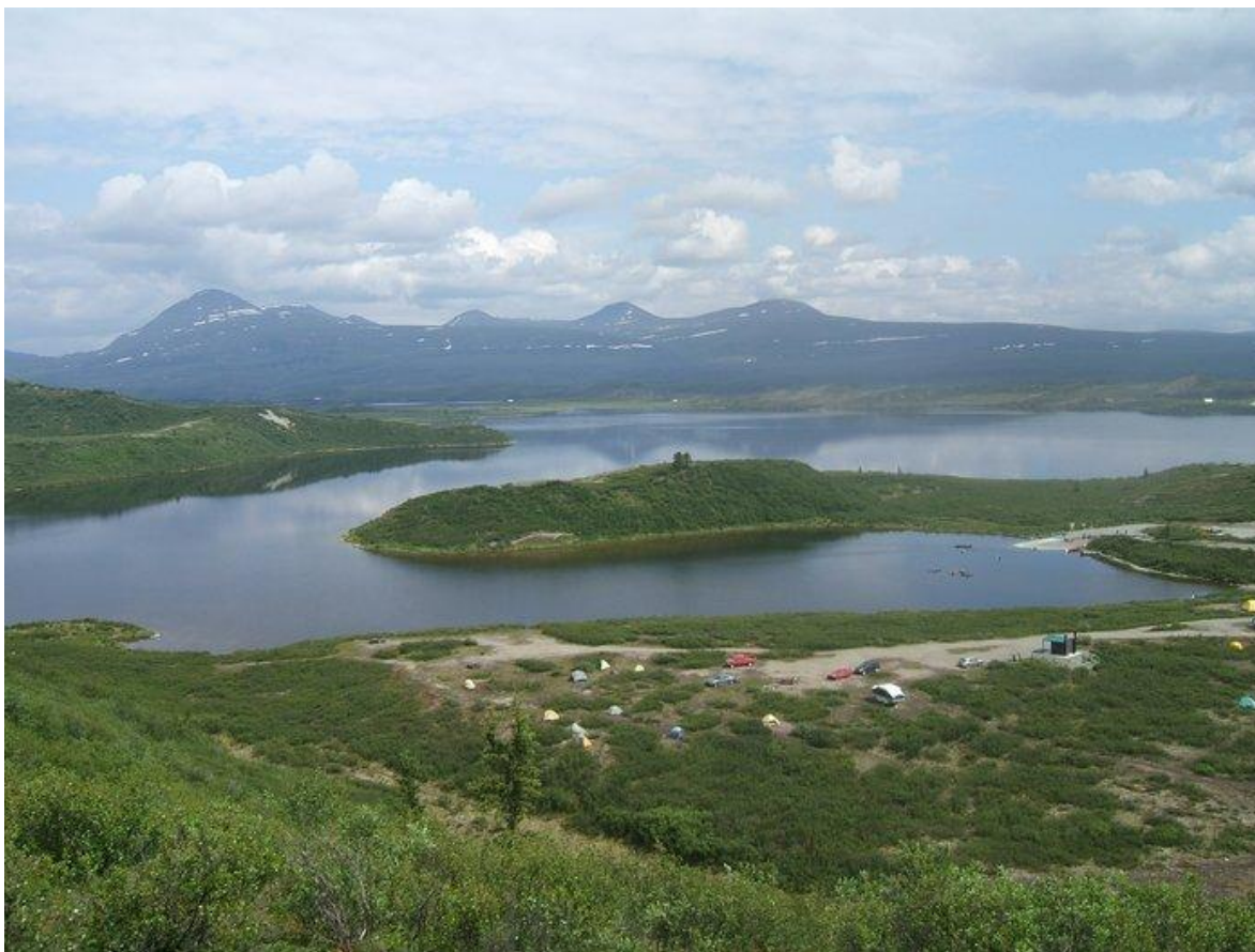
TANGLE LAKES RECREATION — A Recreation Area at Tangle Lakes — Get Photo ( /photos/tangle-lakes-recreation/ )