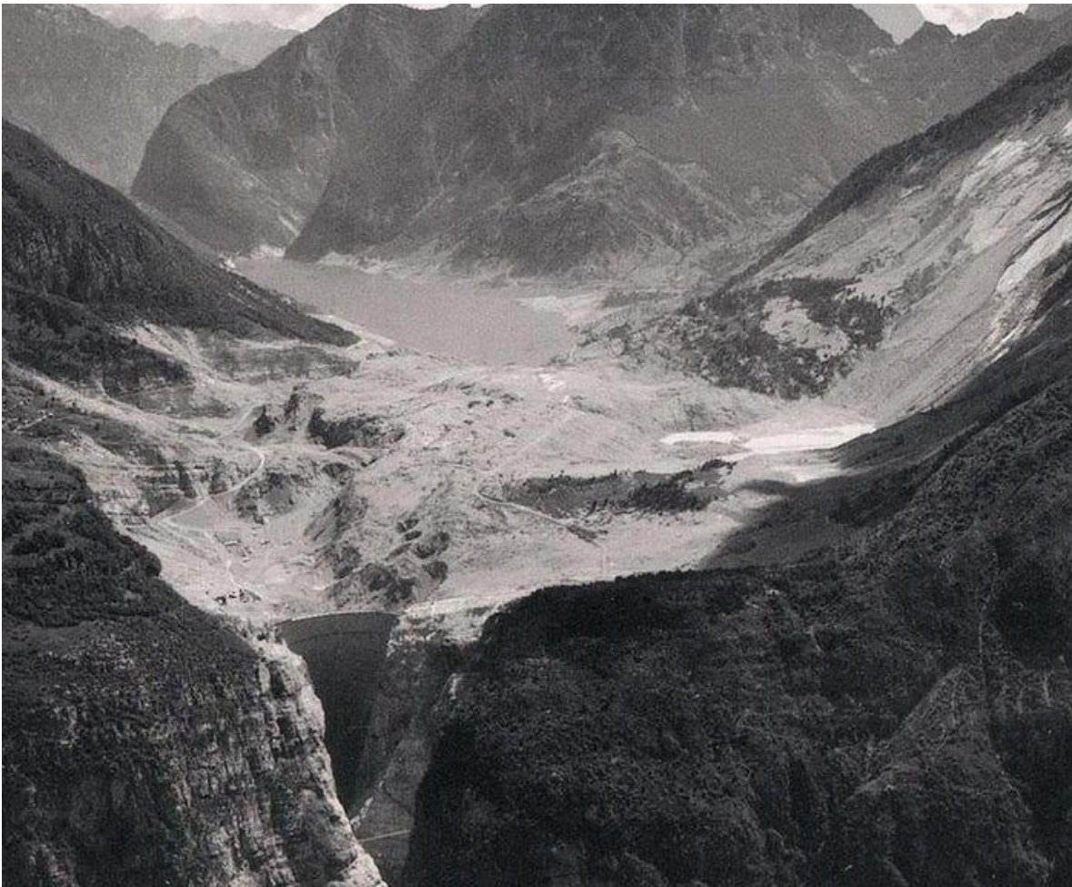
VAJONT DAM AFTER THE LANDSLIDE — Vajont's reservoir was mostly displaced by a massive landslide, creating a wave that crested 500 feet over the dam's rim. The dam

& Ghirotti's " The 1963 Vajont Landslide " ( http://www.vajont.info/gGeoAppl.pdf ) and Marco's " Decision-Making Errors and Socio-Political Disputes over the Vajont Dam Disaster " ( http://www.academia.edu/1941240/Decision_making_errors_and_socio-political_disputes_over_the_Vajont_dam_disaster ), and lightly from the history presented in Risky Ground . ( http://www.sfu.ca/cnhr/newsletters/RiskyGround_News_2013-09-21.pdf )