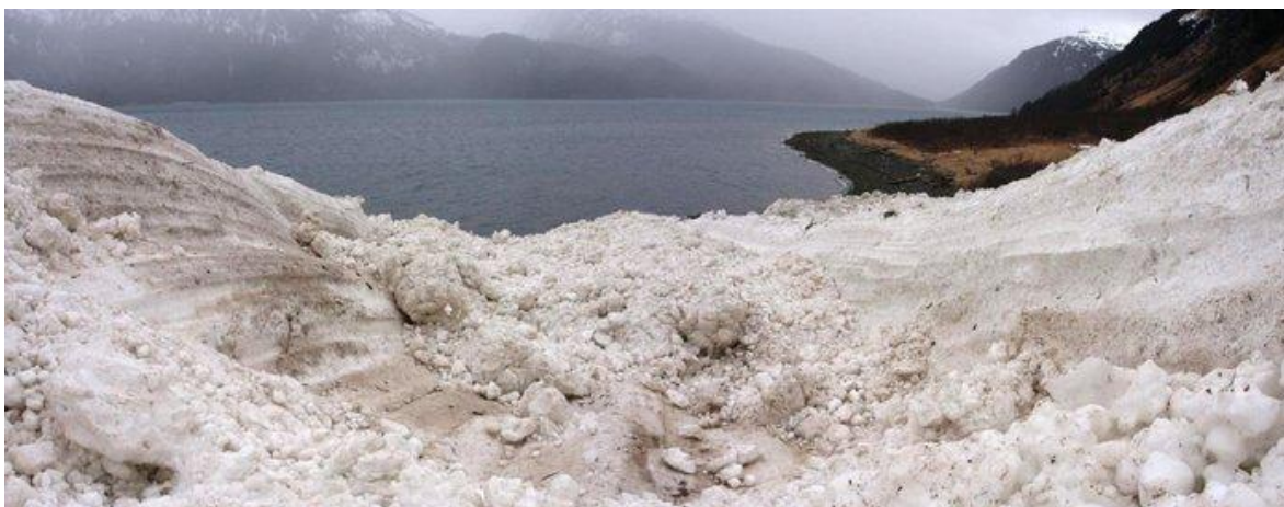
— Avalanche along Port Dick — Get Photo (/photos/_16/)

modified to be usable as a life vest, topped by a loose poncho-like dress of silnylon. The effect of the last two items, particularly, gave Hig the look of a boxy-looking football player in a Hefty trash bag. We were still soaked.