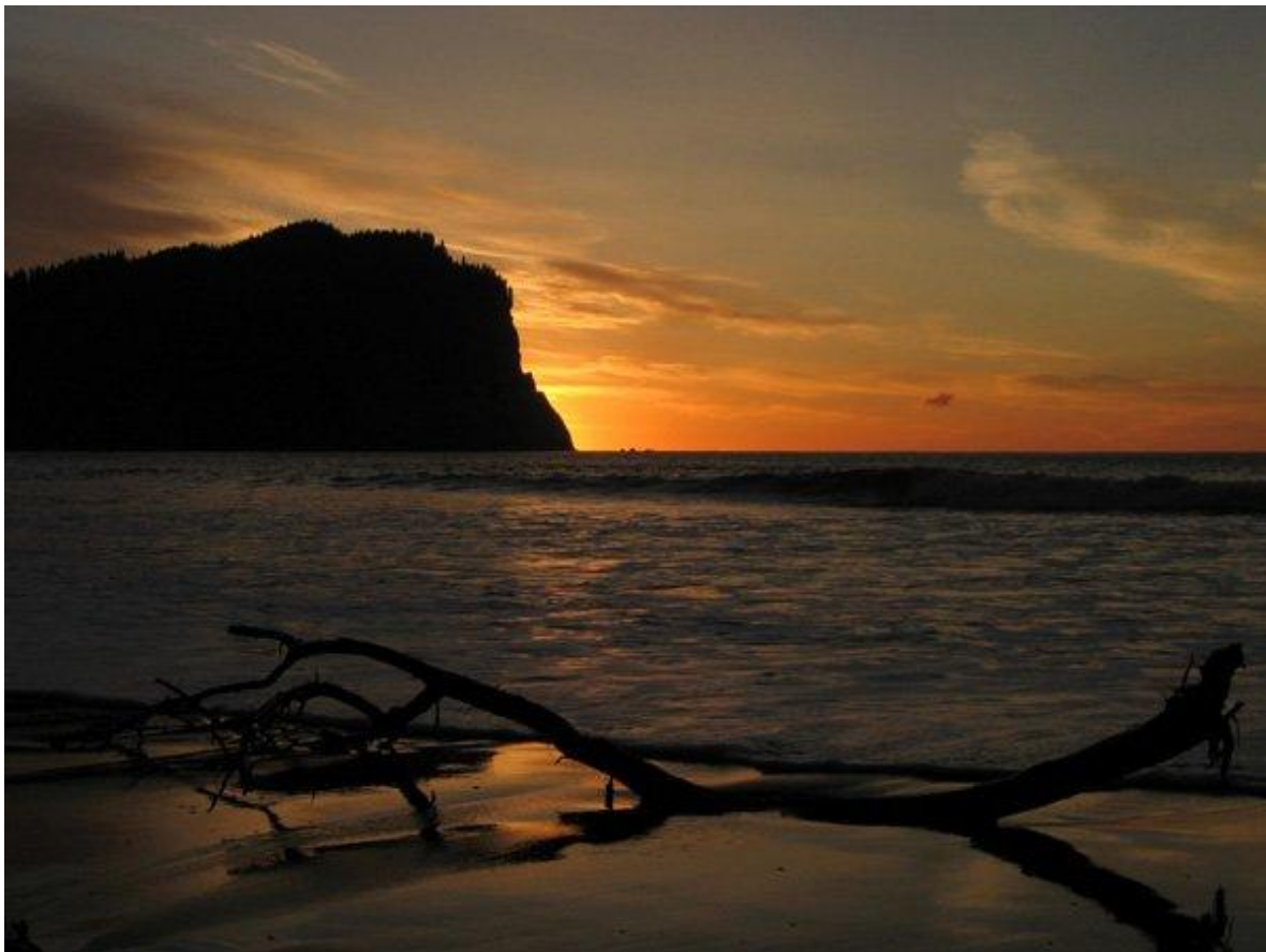
— Gore Point sunrise - 2004 — Get Photo (/photos/_15/)

mountains, Gore Point is barely accessible by land, and far from civilization by water. Most of its infrequent visitors are fishermen landing on the sole protected beach. Hig's obsession with this place started in childhood, listening to his fisherman father tell stories of the storm-battered beaches.