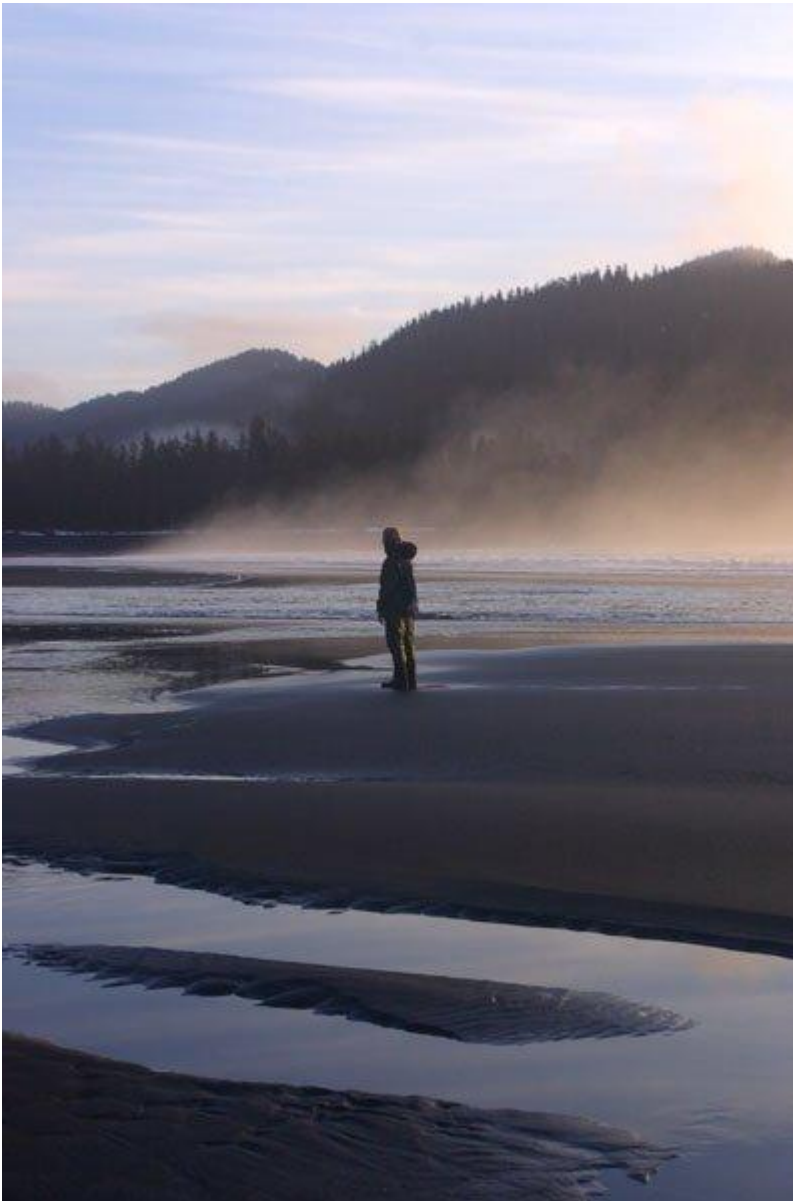
— Sunrise on Gore Point beach — Get Photo ( /photos/_18/ )

The next morning, a cold fog streamed out over the forest from the frozen Gore Point Lake, meeting the mist that formed over the crashing surf. The sun rising over the ocean turned them both golden, and the colorful reflections of the hills and sky contrasted with the smooth grey sand at our feet. Gore Point was as wonderful in February as it had been in September.