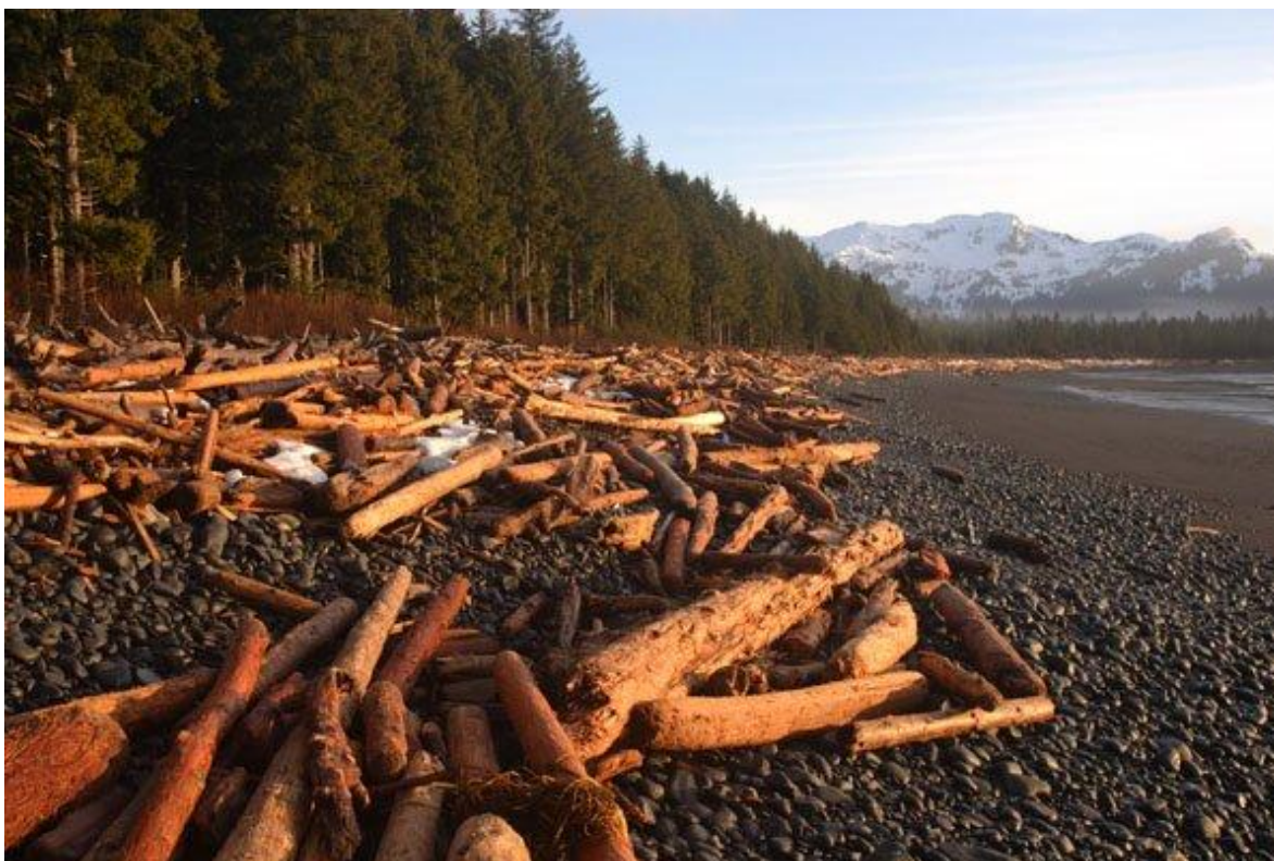
— Gore Point beach — Get Photo (/photos/_27/)

Night fell clear and moonless. We scrambled over the pile of ice-slicked logs at the edge of the forest, out onto the sand flats. The tide was out beyond our sight, but we could still hear the crashing surf. From the forest, a pack of coyotes added their eerie high-pitched yelping and screeching to the sounds of the ocean. Holding hands, we stared up to admire the stars, pointing out the constellations, shivering a little in the cold. I wished I could stretch out this moment for at least another week. But the long and difficult return journey was weighing on our minds. We couldn't afford to linger.