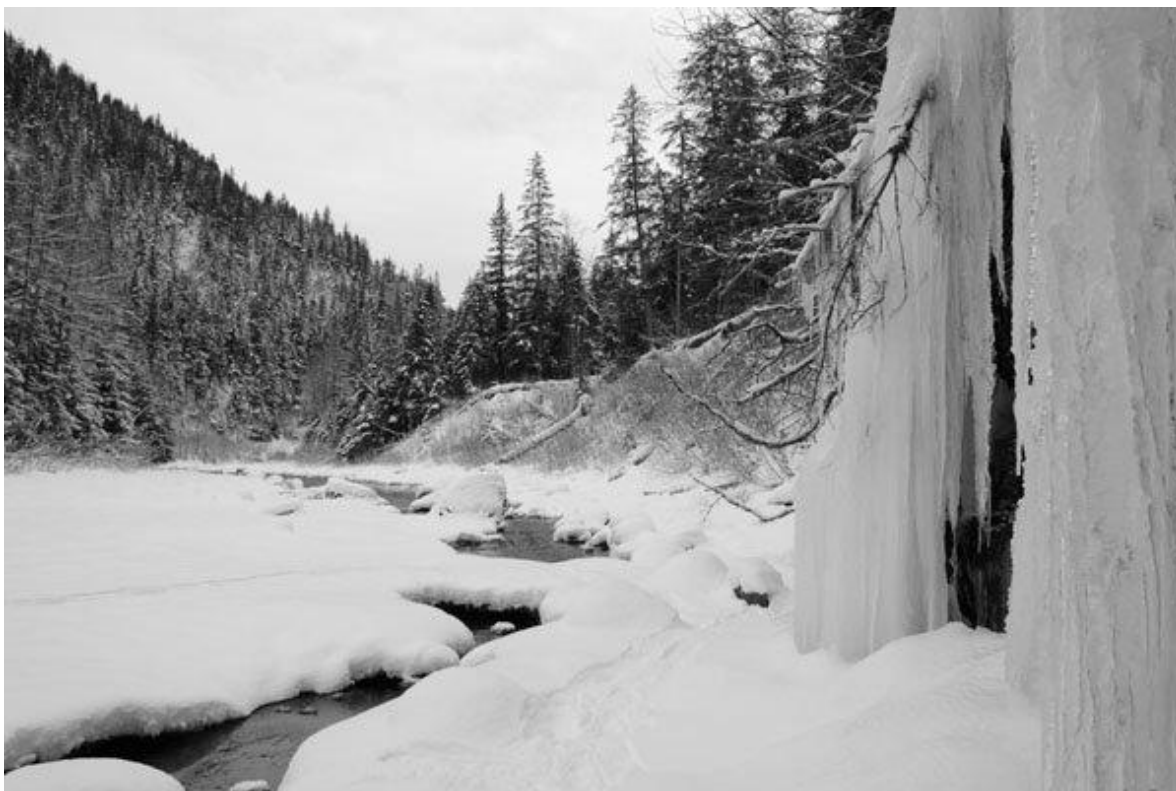
— Rocky River — Get Photo (/photos/_29/)

The rafts floated through weirdly green water, running over ice just a foot beneath the surface. Every few minutes we'd hit an ice dam, and perform an odd form of seated acrobatics with raft and paddle to wriggle over it. But inevitably, we hit a dam that was simply too big.