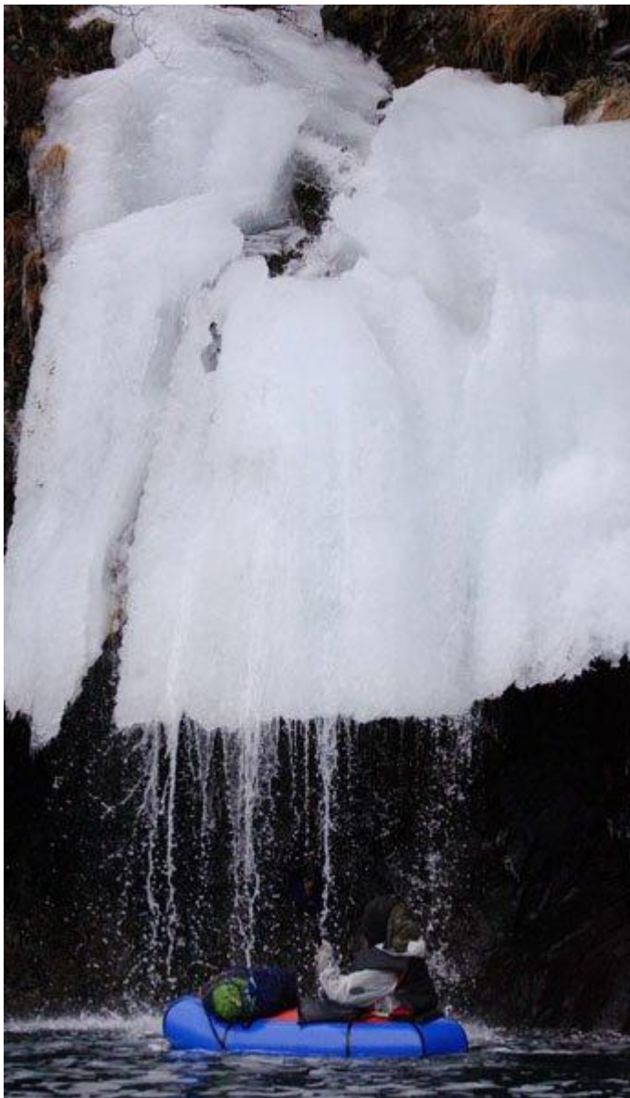
— Frozen waterfall along Port Dick — Get Photo (/photos/_24/)

We rode gently following seas to the head of Port Dick, surrounded by birds and otters taking shelter in the long protected fjord. Dozens of swans shied away from us, lifting off when they were barely white footballs in the distance. They flew straight at us, trumpeting loudly and circling our boats before peeling away.