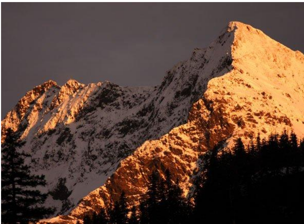
— Sunrise on Port Dick peaks — Get Photo (/photos/_28/)

“Insanity has its benefits, I guess,” I shrugged. “But I knew it would get nice again. That’s the thing about trekking. Nothing lasts forever. No matter how awful the weather or the bushwhacking, or whatever, it always does get wonderful again.”