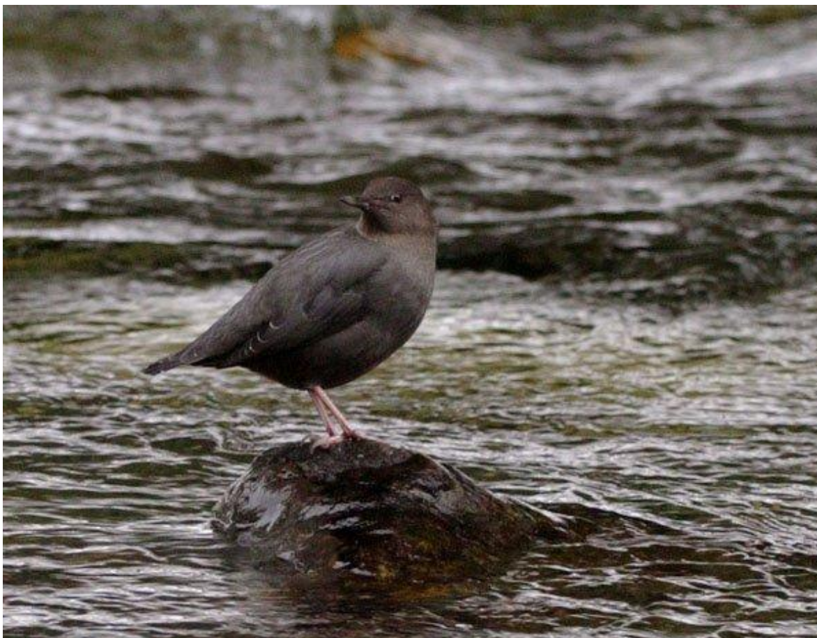
— Dipper on Rocky River — Get Photo (/photos/_30/)