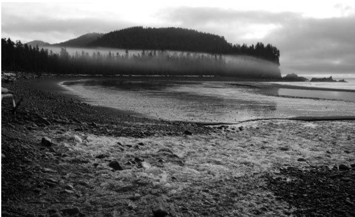
— Gore Point beach — Get Photo (/photos/_33/)

Looking up at the sparkling sky, we twirled in place a few times, making ourselves dizzy. Then we scurried back to the warmth of the fire, and repaired gear for our return.