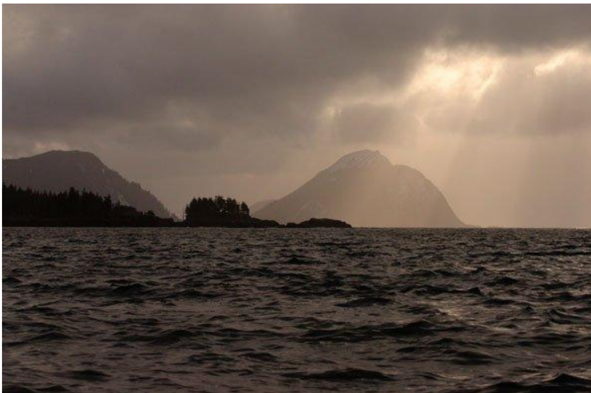
— Gore Point in a spot of sun — Get Photo ( /photos/_31/ )

In preparing for the trip, we had blithely assumed that the journey out to the coast would pose no real problems. All our worries were focused on the crossing. To reach Gore Point, we needed to paddle at least two miles across a fjord open to the Pacific Ocean. And as we were planning our trip, we obsessed over this crossing. There would be no land between us and the ocean to block any of the swell. Packraft landing spots would be few and far between, and possibly battered by surf. We were traveling in the stormy winter, to a place known for its storms.