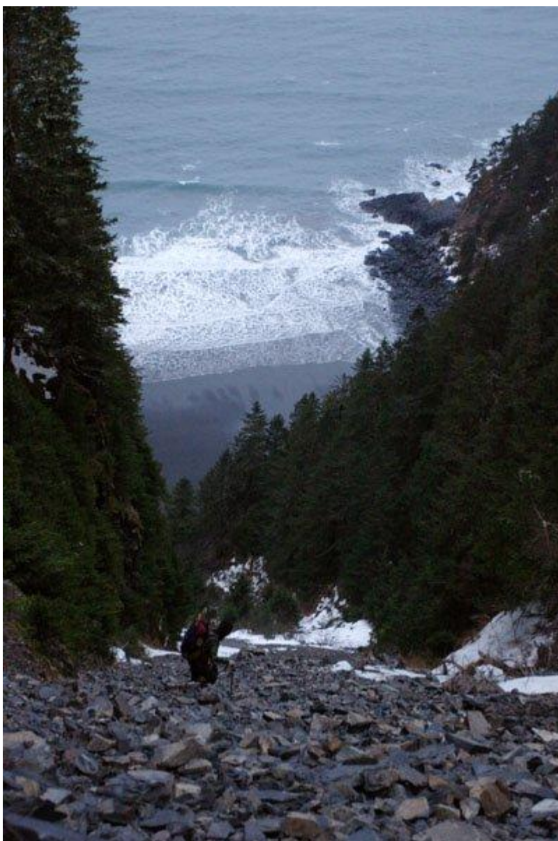
— Descending the chute to Gore Point beach — Get Photo (/photos/_26/)

But our winter boots had little traction on the icy-thin crust of snow, and with the wind blowing us over, there was little margin of error for scrambling on the narrow ridge. We couldn't follow it any further, and were forced to retreat down and away from the howling wind, moving at the fastest creep we could manage.