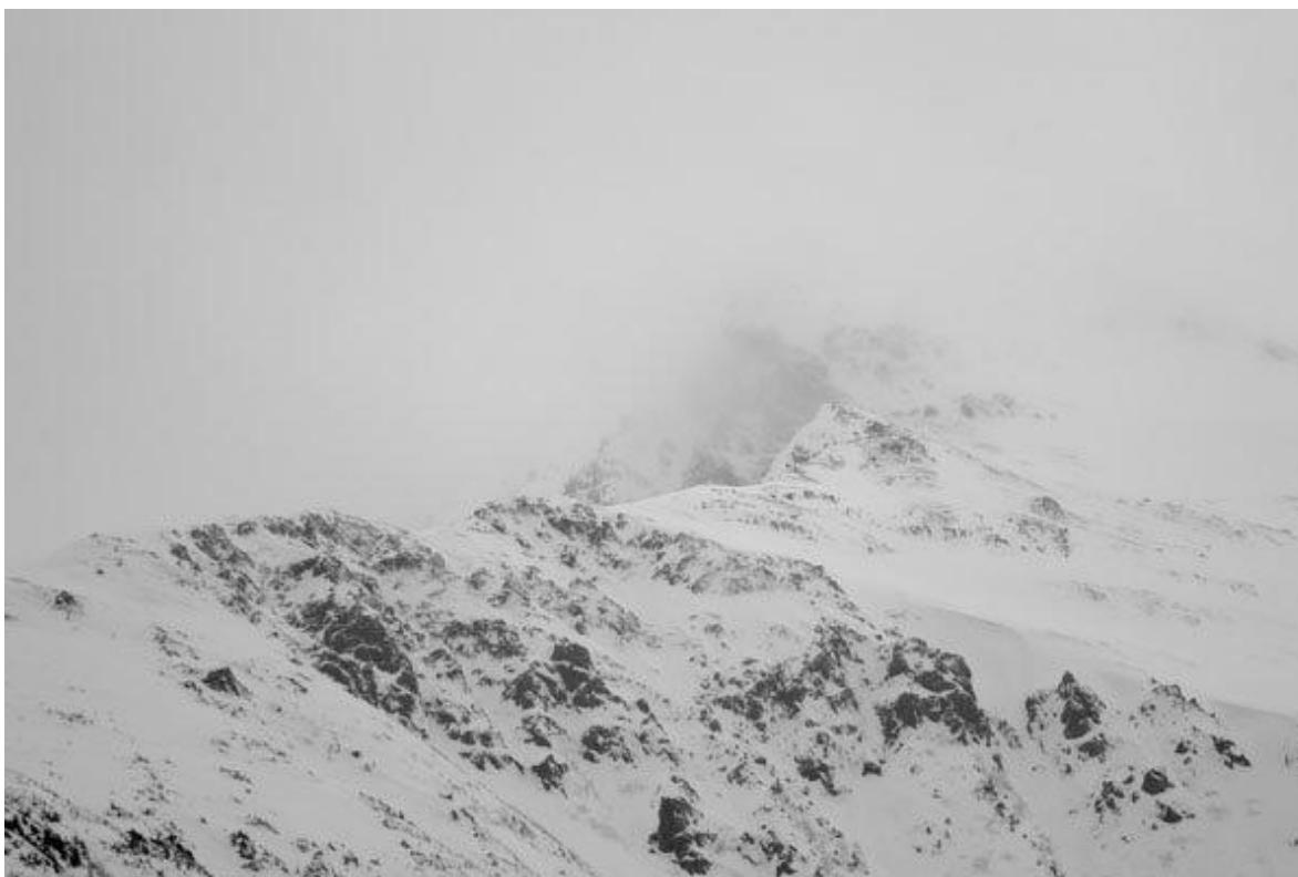
— Peak in the mist, from Port Dick — Get Photo (/photos/_20/)

On the other side, I gathered twigs from the gnarled and wind-sculpted snags, and we cooked dinner, watching the harbor seals play in our protected cove.