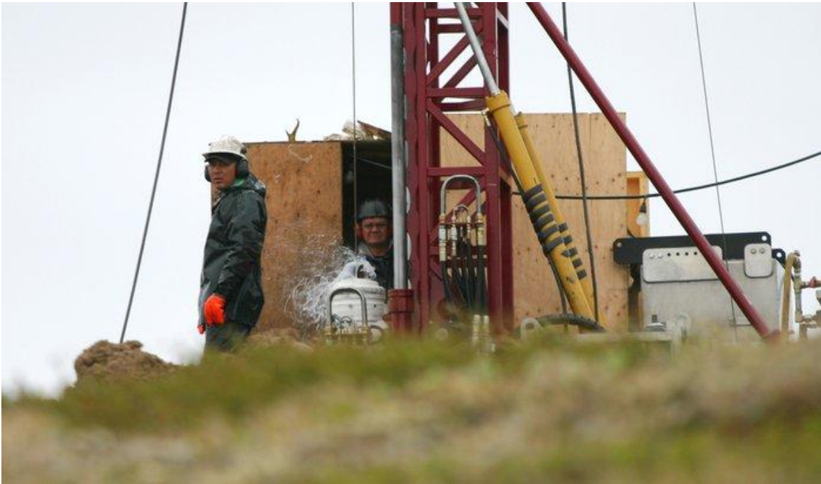
MINE WORKERS — Workers and spurts of water at a drill rig, Pebble East. — Get Photo (/photos/mine-workers/)

120412Ref04_AK_Mining_Industry_Economic_Impacts.pdf ) Although the market value of mining production is often cited in Alaska mining statistics, it actually has little direct relevance to Alaska's economic gains from mining. Many mine-related expenditures occur, and most profits are realized, out-of-state. Instead, the most important cash flows for Alaska's economic health are probably in-state payroll, taxes, and vendor expenditures. Mining also provides in-state revenue in the form of political contributions, advertising, and lobbying.