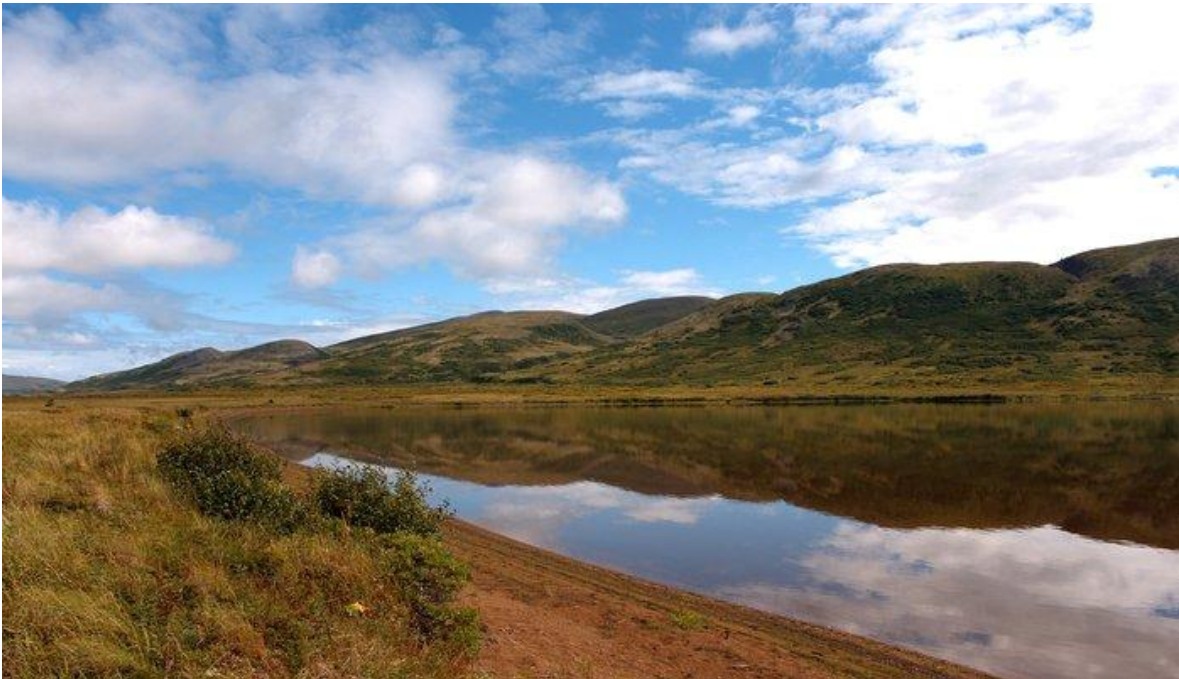
FRYING PAN LAKE — North end of Frying Pan Lake. — Get Photo (/photos/frying-pan-lake_3/)

Northern Dynasty maintains that it has a “no net loss” policy ( http://www.minesandcommunities.org/article.php?a=2953 ) for fisheries in the area which would mean that any loss of productivity would be theoretically compensated for in some other way. These direct effects that Pebble would seek to mitigate include destruction of salmon spawning habitat near the mine, an increase in “total dissolved solids” ( http://en.wikipedia.org/wiki/Total_dissolved_solids ) downstream of the mine, and the release of metal compounds that can interfere with the homing mechanism ( http://pebblescience.org/pdfs/Pebble_copper_salmon.pdf ) of salmon. A similar policy is in effect in Canada, where it includes actions such as attempting to create new habitat near the habitat that was destroyed, or simply paying a lump sum to the government to compensate for