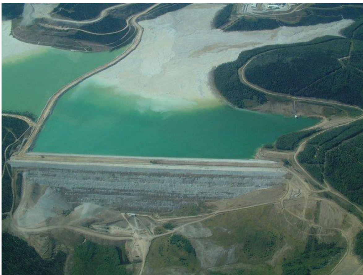
TYPICAL MINE TAILINGS DAM —

This tailings impoundment dam at the Fort Knox gold mine in Alaska is a common method of storing mining waste forever .