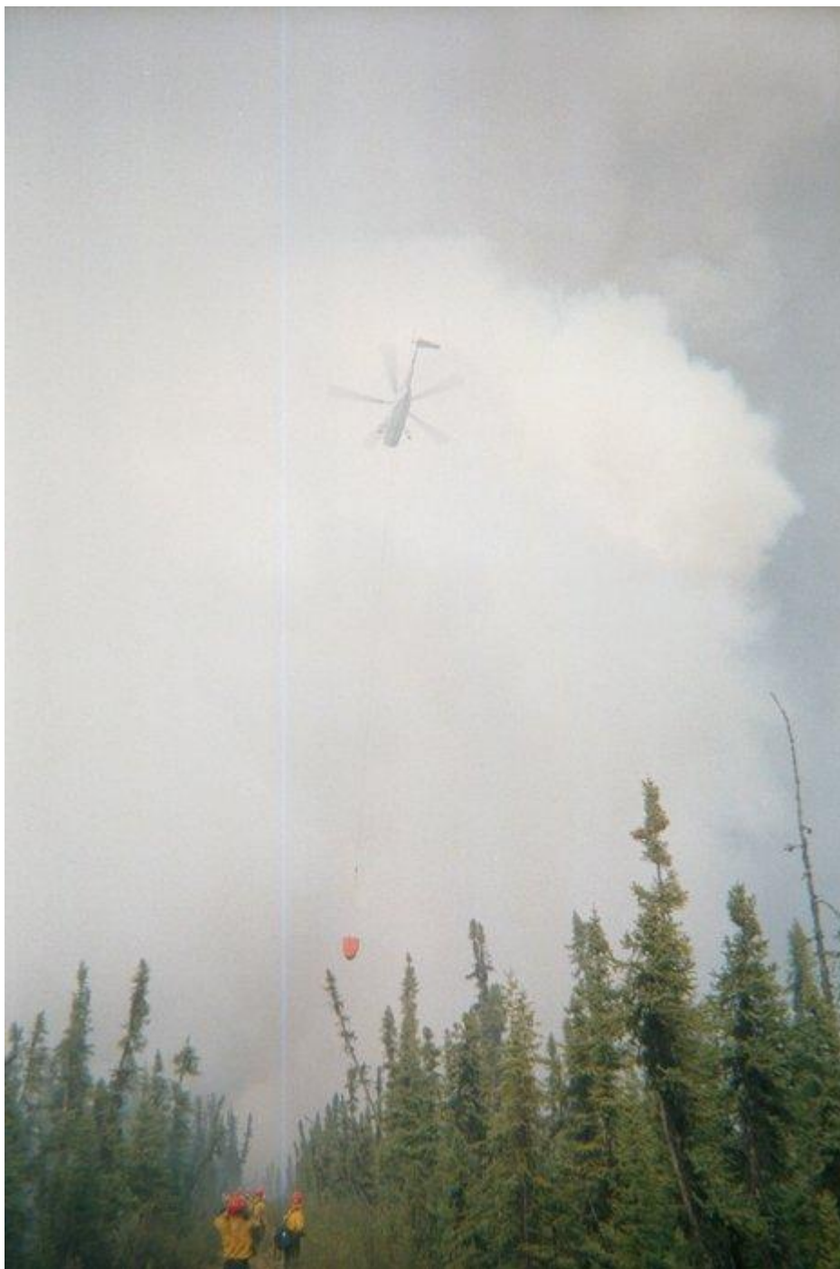
HELICOPTER SUPPORT — Helicopter water-drops support the Baker River Hotshot Crew (IHC), holding a fire-edge during a burn-out operation near Livengood — Get Photo (/photos/helicopter-support/)